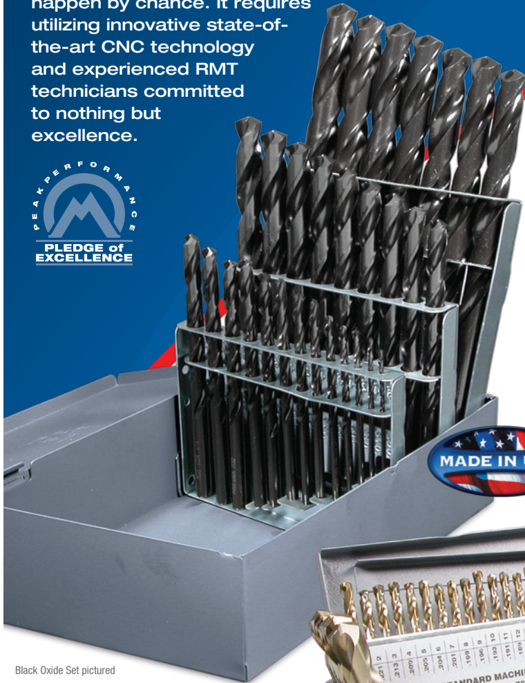
Black Oxide Set pictured