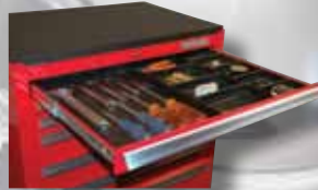
Tools not included