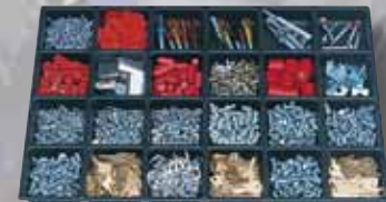
Parts not included